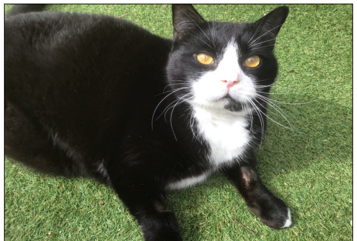
Jersey boy Gatsby