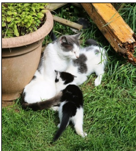
Mum and kittens

Early September I took a call from a member of public who was not from our area, living further afield in